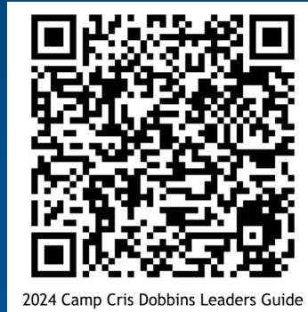
2024 Camp Cris Dobbins Leaders Guide